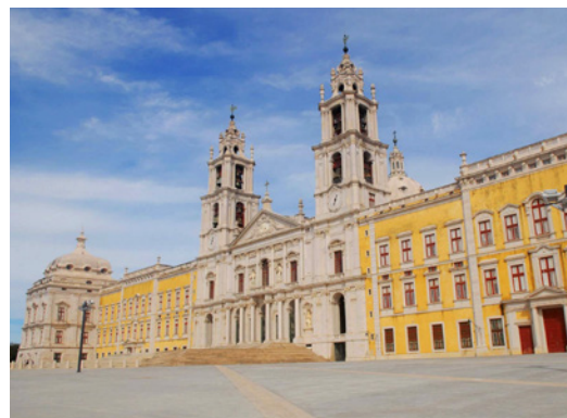
Mafra's National Palace

The study was developed in close collaboration with the technical team and the Tourism Local Council, which represents the local organizations and stakeholders.