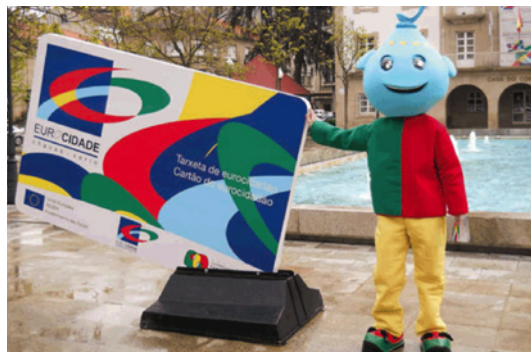
Promotion Action of the Eurocity Chaves-Verín

Today, the Water Eurocity is a reality in full consolidation. The origins of this project was an initiative of the two municipalities and the Atlantic Axis Association which led to the development, in 2008, of a Strategic Agenda. Quatenaire Portugal integrated the cross-border team of consultants that ensured technical support of this agenda. Thus, we would like to congratulate the technical staff and the policy makers that transformed into reality this proposals.