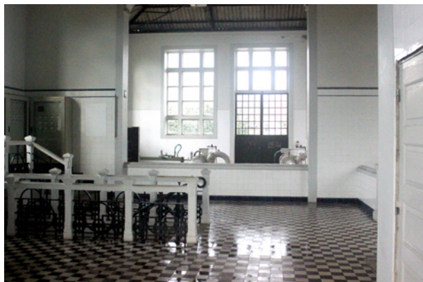
Nova Sintra Central (Porto)

Quaternaire Portugal developed, commissioned by the Atelier 15 – Architecture, the Study for the Enhancement of Águas do Porto's Heritage. This company is heir and owner of a set of infrastructures that are a very valuable heritage, highly significant both in historical and cultural terms, which are currently being partially put out of its regular operation.