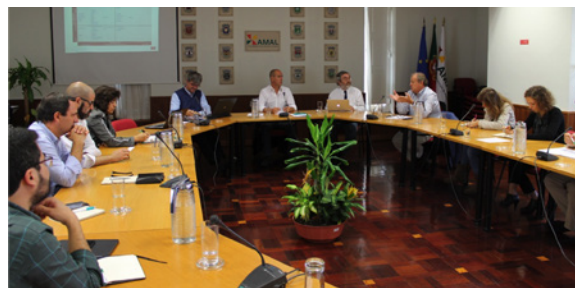
Brainstorming session with local entities on AMAL's strategic positioning, 28 October 2015

After having elaborated for the Association of Municipalities of Algarve Region (AMAL), now organized as an Intermunicipal Community, the Strategic Plan AMAL 2014-2020 in strict conformity with the Regional Strategy Algarve 2014-2020 led by the CCDR Algarve, the Quaternaire Portugal team has been invited by AMAL to elaborate a Strategic Positioning Plan for the institution itself.