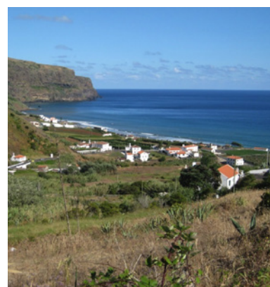
Praia Formosa (ilha de Santa Maria)

These plans – which are a strategic orientation of the Spatial Plan of the Coastal Zone of Santa Maria Island – concern two privileged areas of the island, from environmental and landscape point of view and fundamentally aim at developing a sustainable urban model which is compatible with the environmental vulnerabilities that characterize these two bathing areas of great importance for the touristic sector in the municipality.