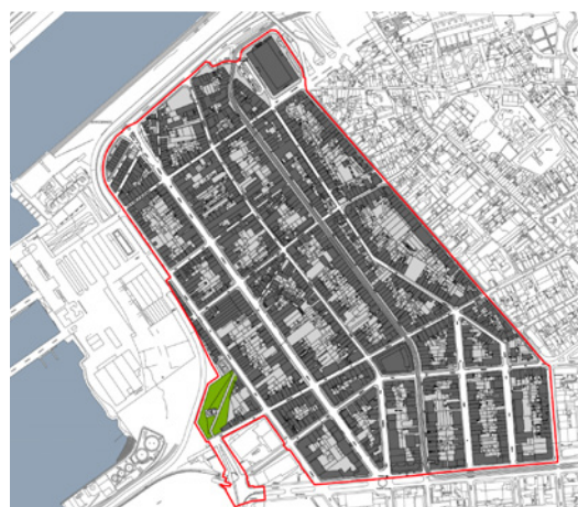
Boundaries of the Urban Rehabilitation Areas of Matosinhos

Within the framework of urban policies, urban regeneration still is one of Quatenaire Portugal 's main market priorities, continuing to develop the Urban Rehabilitation Strategic Programs (PERU) for the Urban Rehabilitation Areas (ARU) of Vila Nova de Famalicão Urban Center (ARU already published in Official Gazette ), for the ARU of Vila de Arouca, Escariz-Fermado and Alvarenga, both in the Municipality of Arouca (already published in the Official Gazette ) and the ARU of Matosinhos and Leça da Palmeira (recently published in the Official Gazette ).