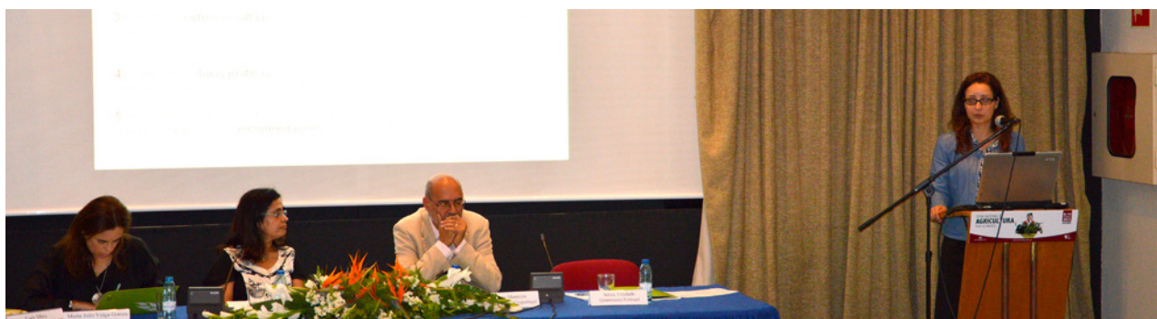
Seminar "Internationalization Strategies of Agrifood Row", held on 11 June 2015 at the Santarém's Agricultural Fair, where it was presented a balance and the preliminary results of the external evaluation carried out by Quatenaire Portugal the project "Flavours of Portugal"

The project "Flavours of Portugal", co-financed by Operational Competitiveness Programme COMPETE, part of the National Strategic Reference Framework 2007-2013 and framed in Incentives Systems to Enterprise Investments, specifically in the SME Qualification - Incentive Scheme for the Qualification and internationalization of SMEs, was the first experience of the Confederation of Farmers of Portugal in developing joint projects for participation of SMEs in the agro-food sector for international exhibitions with the aim of supporting their internationalization.