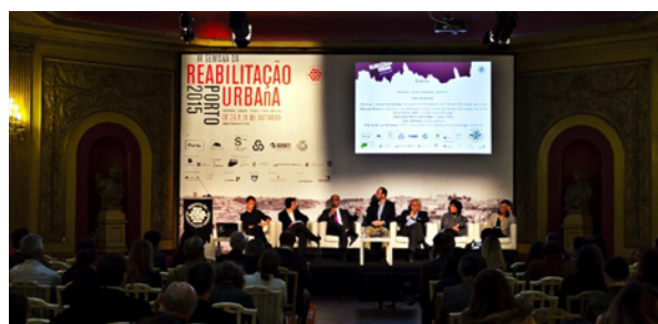
Debate "New horizons for Porto's urban regeneration", held on 30 October, at Ateneu Comercial do Porto.