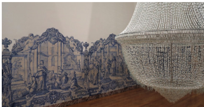
MACE –Elvas Museum of Contemporary Art

In this project the Quaternaire Portugal team worked in coordination with public and private actors operating in this territory, in order to consolidate an integrated tourism product and increase the level of trust and satisfaction of visitors and tourists, while protecting the integrity of the heritage assets and the benefits for local communities.