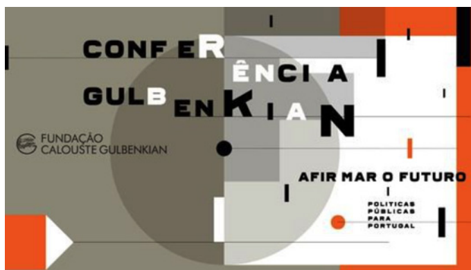
Pictograph Conference and Publication Claiming the future: public policies for Portugal