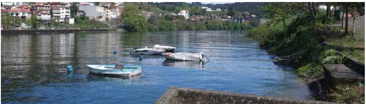
Urban occupancy on the shoreline

The Crestuma-Lever Special Public Water Reservoir Programme started to be developed in 2019, more than one decade after the Land Use Plan also developed by Quaternaire Portugal for this reservoir came into effect. The task at hand is to adjust the special programme to new special plan requirements, such as to ensure alignment with the changes to the legal framework effected in 2014/2015. Moreover, the special programme seeks to update the solutions specified in the plan, taking into account the region's current socioeconomic conjuncture.