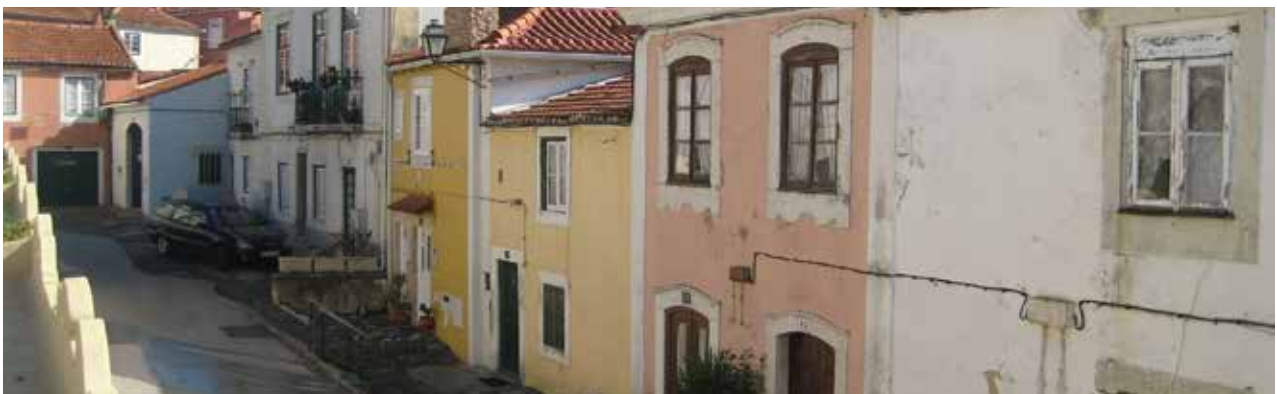
Historic centre buildings in Odivelas

The Plan was publicly discussed in August and September of the current year. Efforts are currently underway to produce the final version, which will be submitted to the Odivelas Municipal Council for approval.