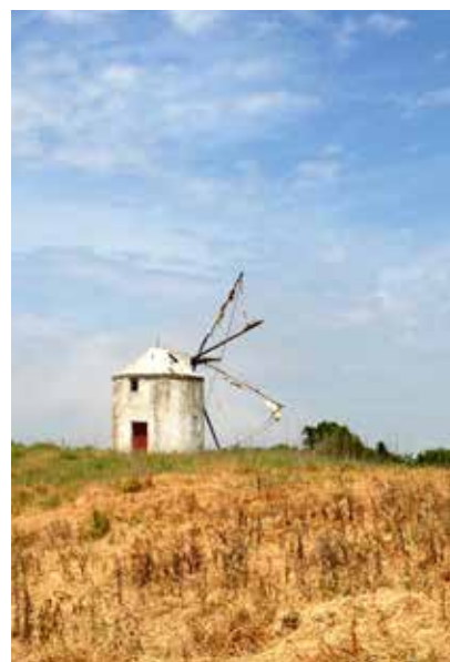
Cesaredas Plateau landscape

The first stage of the study involved an analysis of existing assets and infrastructures at the Plateau. The second stage entailed the definition of adequate themes and their possible interpretation, followed by circuit design, planning of required operations and definition of a communications plan.