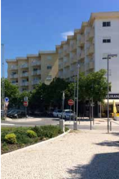
Fátima's urban landscape

Quaternaire Portugal started the second review of the Fátima Urban Development Plan in 2019. Since 1995, this plan has set guidelines for the urban development of Fátima, a sanctuary city of high religious and symbolic value for the Catholic world.