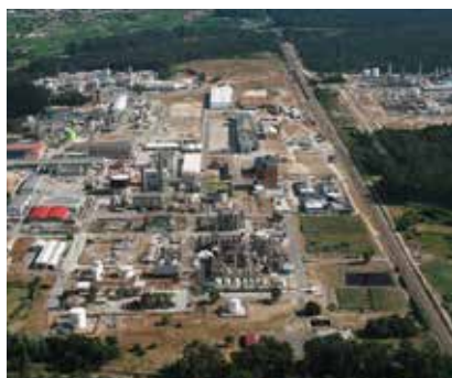
Estarreja Industrial Estate

In an effort to define strategies and initiatives aimed at improving relationships and building trust between the Estarreja and Sines industrial estates and the local communities, including dwellers, administrative bodies and social institutions, the Portuguese Association of Chemistry commissioned a study on the social outcomes of the industrial activities involved.