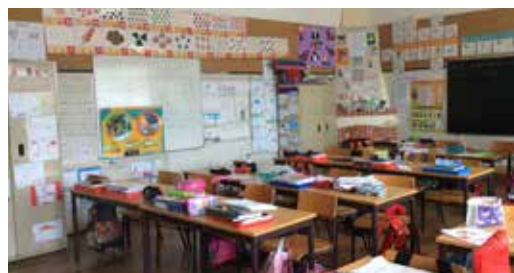
School classroom in Olhão

The Olhão Municipal Strategic Education Plan (MSEP) seeks to provide a series of guidelines for promoting education, training youths and adults, and fostering lifelong learning.