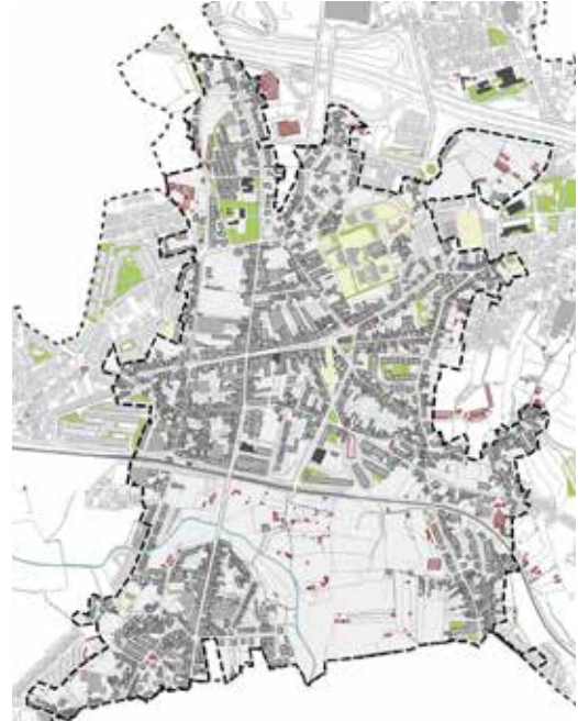
Study site delimitation

São Mamede de Infesta is currently seen both as a starting point for extending urban renewal efforts to other urban areas within the council, and as a priority, owing to the many issues affecting the area in question and the potential opportunities already envisaged. The study is expected to be completed by the end of the year.