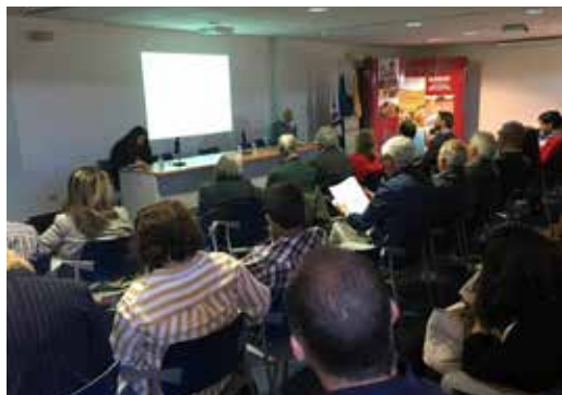
Working session with rural development stakeholders

Community-based local development (CBLD) strategies represent a possible approach for using available funds for local development and economic diversification in specific regions, whether urban, rural or coastal, in the 2014-2020 period. Regarding rural areas, this type of strategies can be translated into innovative policies primarily based on the LEADER approach, a tried and tested model adopted within the scope of the European development policy framework.