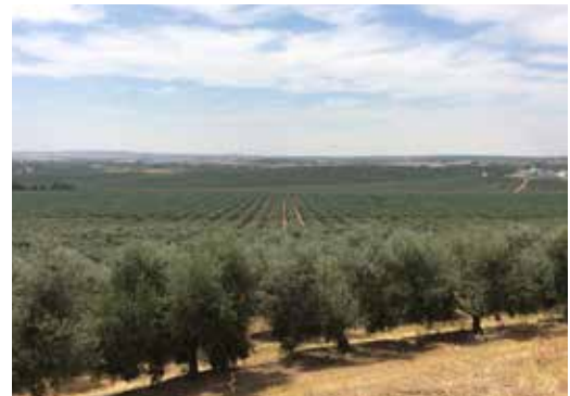
View of the Estate's olive grove

The RDP, which is expected to be completed within 6 months, is currently at the plan proposal stage