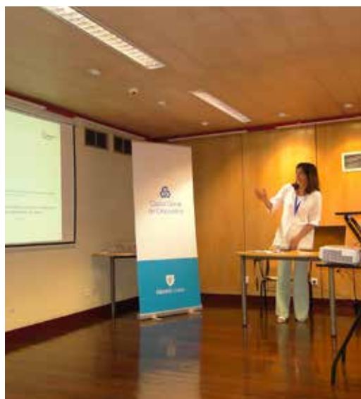
Image of the event