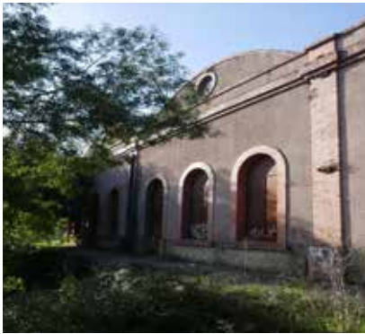
Foz do Sousa Station

Quaternaire Portugal designed an evaluation study and produced a proposal for rehabilitation of the former Foz do Sousa Station for water supply company Águas do Douro e Paiva, S.A. The building, which is currently vacant, has been classified as a Heritage Site, as its history is linked to the origins of the Porto water supply system.