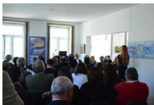
Douro's Inland Waterway: workshop on "industrial policy and economic growth", in Gondomar