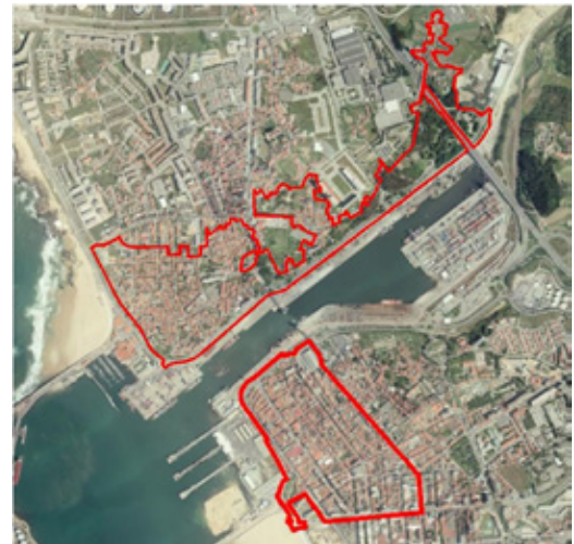
Matosinhos and Leça da Palmeira Urban Renewal Areas

In this way, Quaternaire Portugal believes it can support public and private investors in the preparation and negotiation of their applications to these different funding schemes.