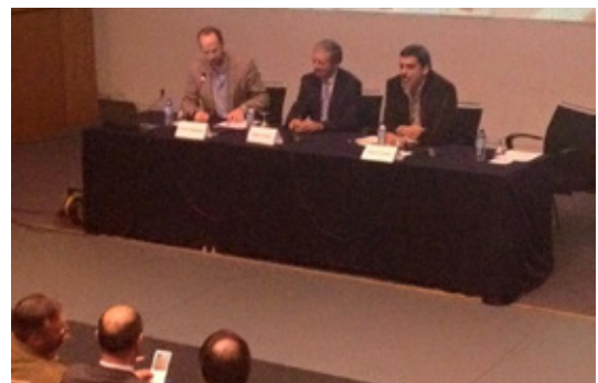
Braga, seminar on public housing