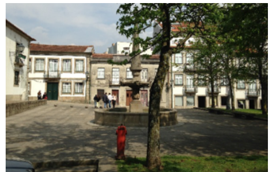
Square in Vila Nova de Famalicão