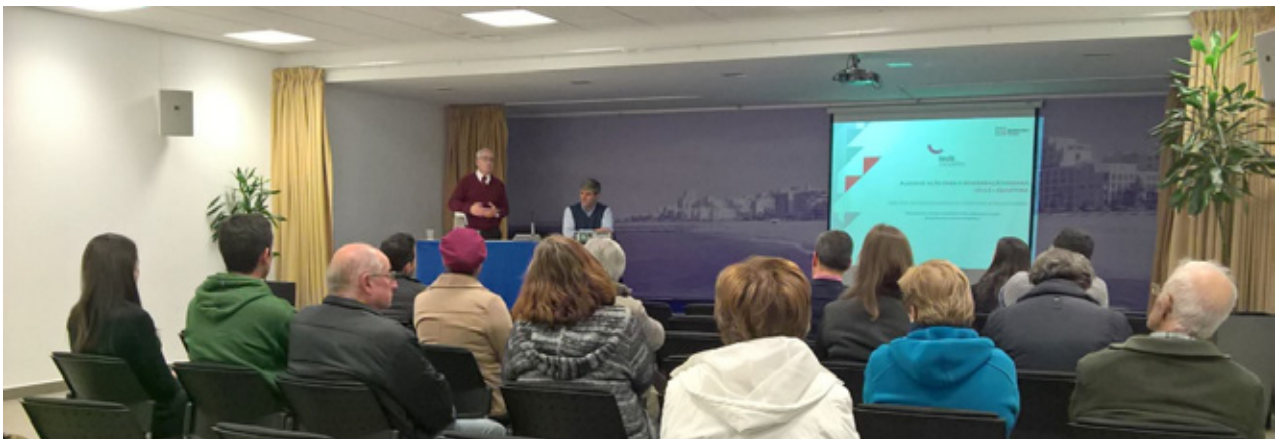
PARU and urban regeneration funding schemes presentation in Quarteira

After a task force (completed in September 2015) in order to conclude the preparation of Arouca, Braga, Guimarães, Mangualde, Matosinhos, Porto, Santo Tirso and Vila Nova de Famalicão's PEDU, followed by monitoring the negotiation between the Municipalities and North 2020's Management Authority, Quatenaire Portugal 's team concluded Mora and Viana do Alentejo's PARU applications to Alentejo 2020 and Albufeira, Loulé and Quarteira's PARU application to Algarve 2020. It is still in progress the development of Póvoa do Varzim's PARU. Moreover, in the Azores Autonomous Region Quatenaire Portugal is working in PIRU for Madalena, Vila do Porto, Pico, Graciosa and Lajes Corvo.