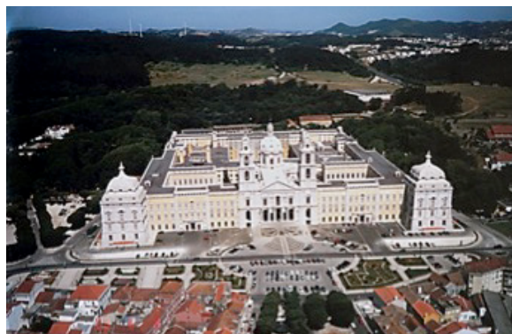
National Palace of Mafra

Also the company provided advising to the Performing Arts and Music School (ESMAE) of the Porto Polytechnic Institute, concerning funding opportunities in culture.