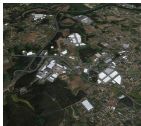
Santo Tirso – Industrial Zones around Labour Road

In the case of the Northern Region, the company collaborated with Santo Tirso Municipality in the preparation of two business area projects; with the Association of Municipalities of Terras de Santa Maria, in defining the territorial model and programme of action for the consolidation of the business location system in this southern region of the Porto Metropolitan Area; and with the Intermunicipal Community of Alto Tâmega in the modernisation and upgrading of its network of business areas. These are distinct projects, with almost contrasting scales, objectives and contexts, but with a common spirit: optimise social gains through integrated planning, focused on the competitiveness of enterprises and territories. Equivalent planning processes are currently underway in the Centre Region, where Quaternaire Portugal collaborates with the City of Figueira da Foz in the project for expansion and upgrading of the Industrial and Enterprise Park, also providing technical support to the team that is developing the design of Business Areas in Mangualde.