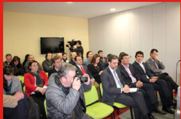
QNAS discussing meeting in Dão-Lafões

In 2015, regional in-depth processes targeted at establishing experimental NUTS III agreements on the supply of vocational courses, involving Intermunicipal Communities, Vocational Schools, Regular Schools offering vocational courses, entrepreneurs, municipalities and other local and regional institutions. Quaternaire Portugal technically supported six NUTS III agreements, from north to south: Alto Tâmega, Trás-os-Montes, Cávado, Dão-Lafões, Médio Tejo and Lisbon Metropolitan Area. In some of these processes, the regional in-depth anticipation of qualification needs evolved jointly with some work concerning the fight against school failure (Alto Tâmega) and of elaboration of Employability Pacts (Cávado).