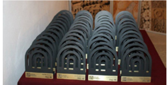
Romanesque Route Quality Labels