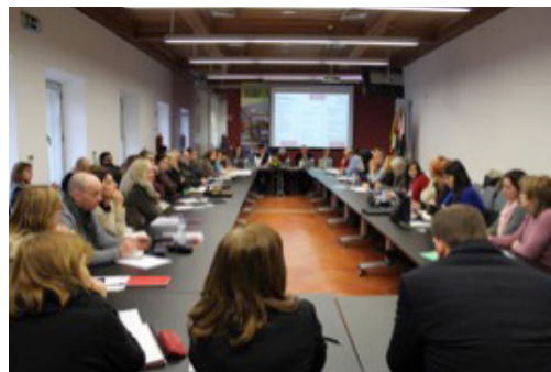
QNAS discussion meeting in Middle Tejo

We should also highlight the participation of Quaternaire Portugal in the Douro's Inland Waterway 2020 project , promoted by the Douro and Leixões Port Authority (DLPA), which recently assumed new responsibilities in the Douro navigability, sharing responsibilities with other entities with jurisdiction over the Douro river.