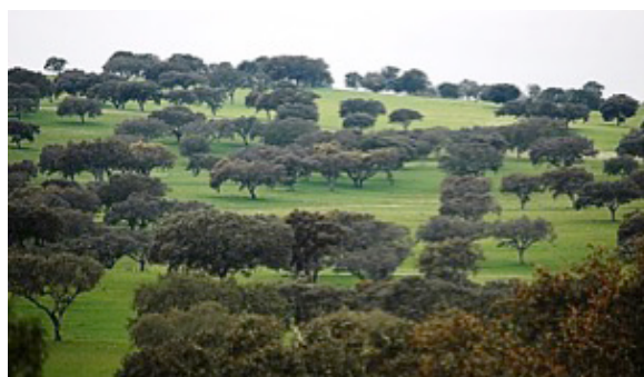
Montado's Landscape in Alentejo Region)