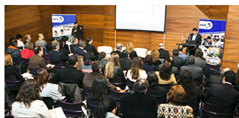
Human Capital OP anual event